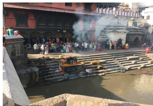
Picture 5 Cremation ceremony at Katmandu