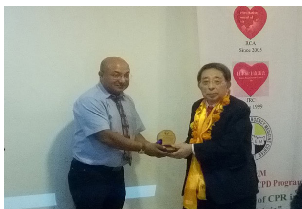
Picture 4 NADEM Token of Appreciation 2017 Presented