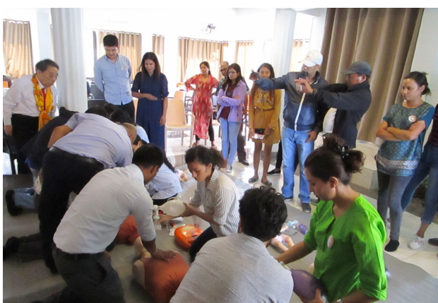
Picture 2 Training at NADEM